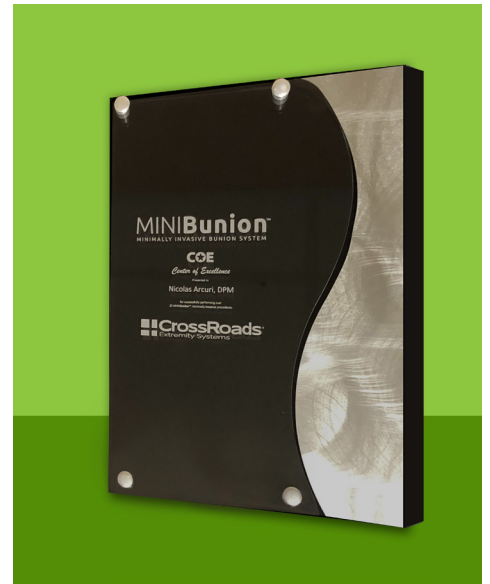
Surgeon Education Plaque